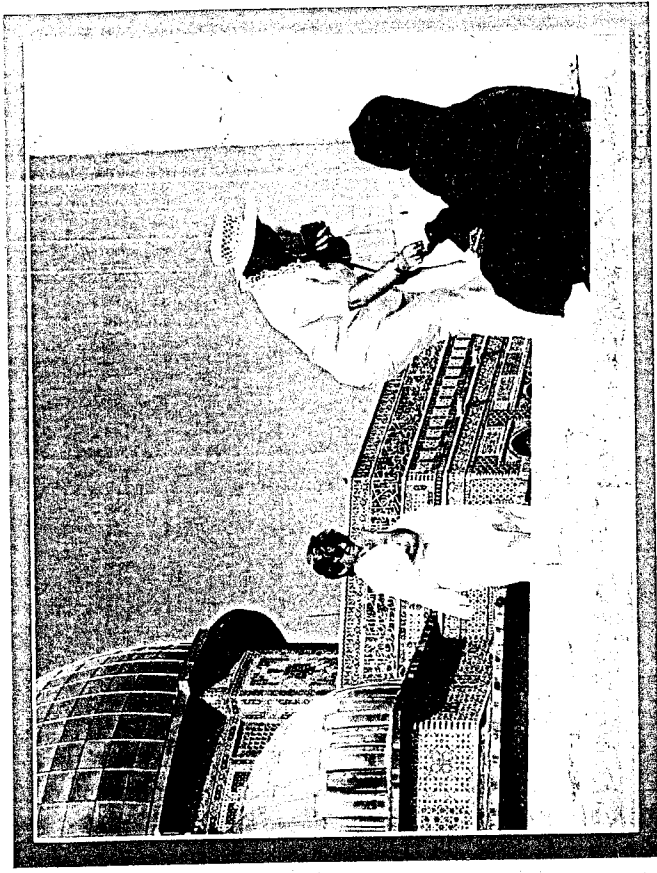
Figure 2. Almsgiver and a beggar outside the Al Aqsa Mosque (IL 5396)